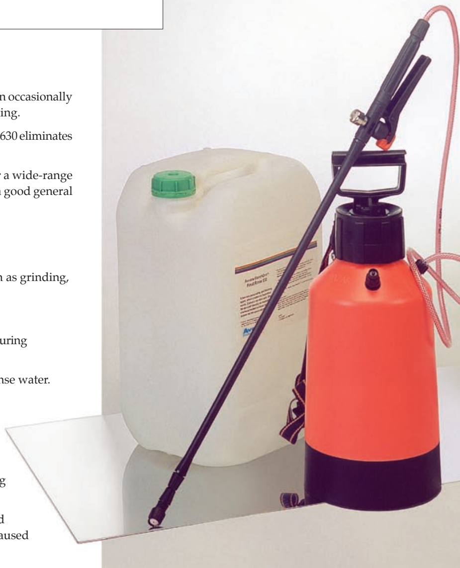
Avesta FinishOne™ Passivator 630 – efficient and environmentally safe.