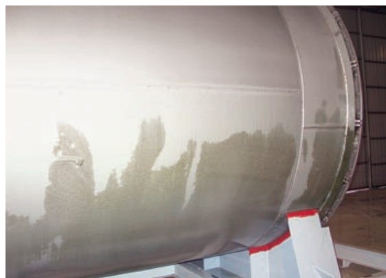
Avesta FinishOne™ Passivator 630 – removes free iron (the brown staining seen on the photo).